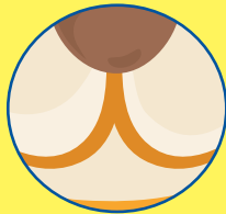
Around the lips