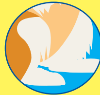
Groin and belly