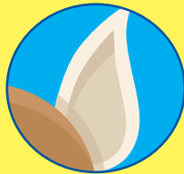
Tips of the ears