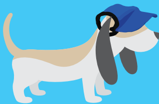
Hats with ultraviolet protection